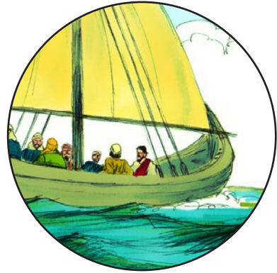
Jesus went to the back of the boat and fell peacefully asleep on a cushion.