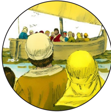
When evening came, He asked His disciples to board a boat with Him and go over to the other side.