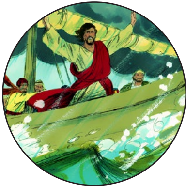
Jesus got up and commanded the winds and waves to be still. Jesus then asked His disciples "Why are you so afraid? Do you still have no faith?"