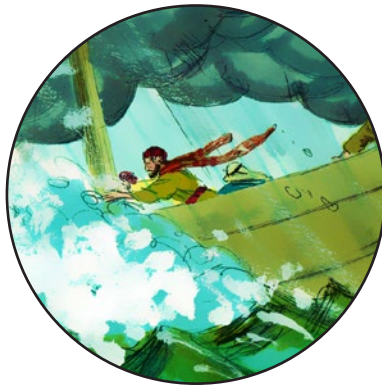
Large waves broke over the boat and it appeared the boat would sink.