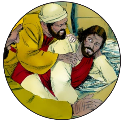
The disciples were afraid they would die. They woke Jesus and cried, "Teacher, don't you care if we drown?"