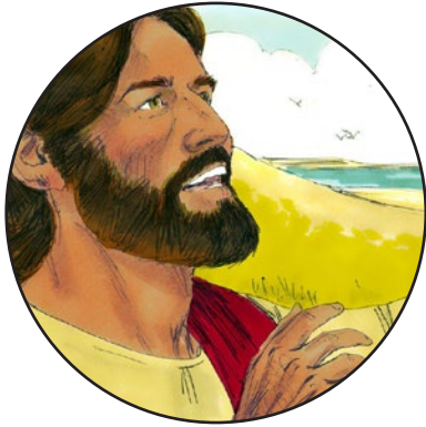
Jesus had been teaching that day near a lake.