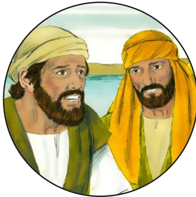
Even though the disciples followed Jesus and heard His teachings, they lacked the faith that He was the Son of God.